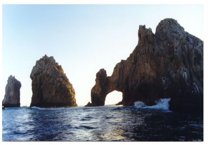
The famous rocks near Lovers' Beach, Cabo San Lucas

The area has almost everything, though the true flavor of Mexico remains for the most part on the mainland. In fact, if anything, this area is too American, particularly Cabo San Lucas, which swells with ever-growing examples of the typical tourist resort: McDonald's, Burger King, the Hard Rock Cafe, hard-sell time-share hawkers, and tequila-filled night life stretching well into the darkness of unending summer. Depending on one's bent, this can be good or bad. There's a lot to do and a lot to see, but be prepared to spend your dinero as the comfortable values found elsewhere in Mexico are noticeably absent from this vacationer's