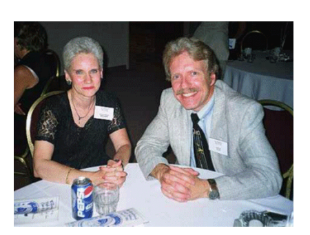
Renewing an old acquaintance.

It's hard to believe that 30 years have passed since high school. I kept wondering if maybe it was just a math error, but there was no denying it when I returned to Chicago for a whirlwind