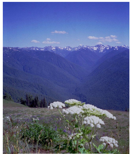
View of the Olympic Mountains from Hurricane Ridge

Epcot was our destination on dav two. Always enjoyable, entertaining, and educational, the events anticipating the year 2000 added even more spectacle than usual, with additional exhibits, a unique parade, and an expanded fireworks display to compliment the natural growth of the complex. We soaked up the ambience of the river rides through Norway and Mexico, enraptured ourselves in a film tour of France, dined delicious in Japan, and reveled in the holiday choral concert before the skies were set ablaze to close the day's activities. Arigato, Epcot.