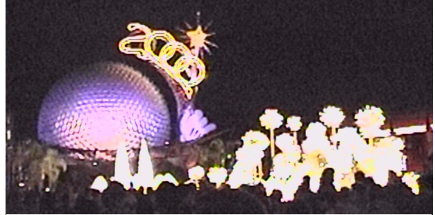
Epcot during the last days of 1999.

polar bears. Be sure to take a sweater, it's chilly in there! The main show, of course, was quite a demonstration of training. The antics of several varieties of porpoise preceded the Orca whales with snappy opening numbers. By the end of the show, though, those in the rows closest to the pool were tapping