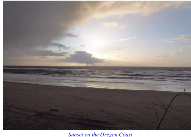
sunsei on the Oregon Coast