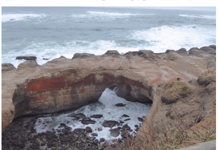
Devil's Punchbowl near Depoe Bay, Oregon

In August we went to Birch Bay, a regular stop on our tours. (See previous newsletters for anything you might want to know about that.) Then there was Coeur d'Alene in north Idaho. We were a little