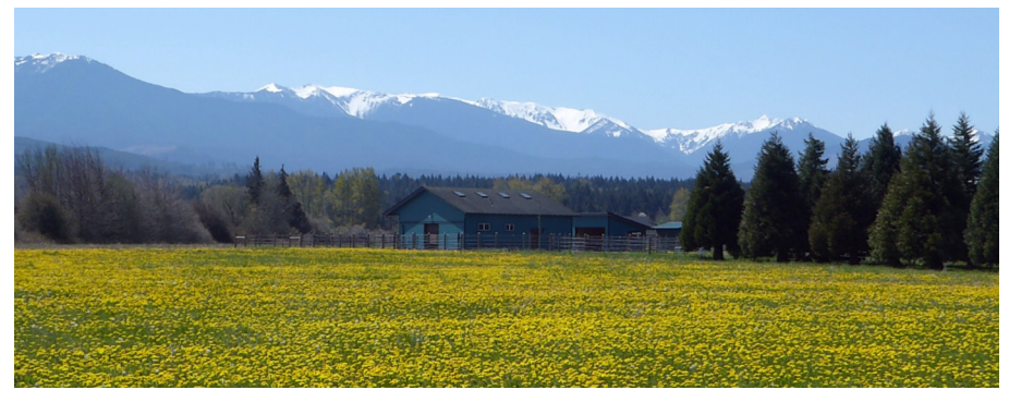
A flowered field near Sequim, WA

Our failure to see whales on our Gleneden trip was made up for at Discovery Bay. One morning about 9AM we noticed some motion in the water halfway across the bay and almost directly in front of the resort. A pod of some eight or nine Orcas had decided to enter the bay and frolic there for an hour or so before heading back out to the strait. It was the first time we'd seen them in the wild and we didn't even have to pay for a whale watching tour.