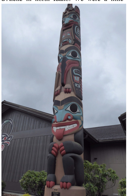
Totem carving at 7 Cedars Resort & Casino near Sequim, WA