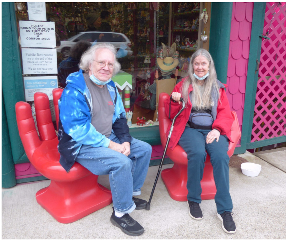
In front of the Christmas Cottage in Lincoln City, OR

I can't quite tell if retirement has begun or not. Maybe circumstances have made it difficult to recognize, maybe I'm getting too old to tell, or maybe I'm just being gaslighted. As the year moved ahead I put in fewer and fewer hours for Elcon while they worked to complete a number of projects and I realized I'm just as tired of engineering now as I was when I first started talking about retirement, (really when I first got into the business 51 years ago! Wait! Didn't I say that last year?) but I think I finally reached the promised land.