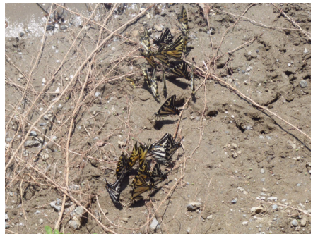
Butterfly "convention" in Leavenworth

hesitant to do this trip as it was a 6-hour drive and was in late October, when weather can be pretty iffy. And coming from western Washington, which is quite liberal, I was a little concerned about the very conservative political environment.