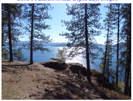
Lake Coeur d'Alene from Arrow Point, ID