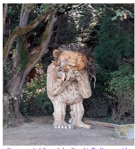
Constructed of discarded pallets this Troll now resides in Lincoln Park just down the hill.

We drove into town to pick up groceries on our way in, and stopped to ask someone where the Costco was. The man who walked over to the car, friendly as he was, still caught us by surprise with his