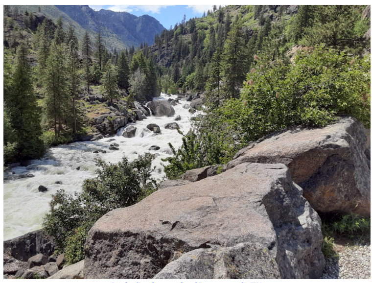
Icicle Creek outside of Leavenworth, WA

group. As the year's end approached and after more editing, came the completion of the third of the four movements of "Arboreum". (No, the second and fourth movements are still to be written.)